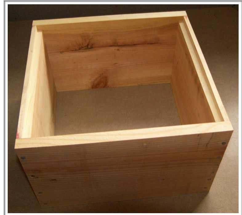
Warre Hive Box with No Top Bars