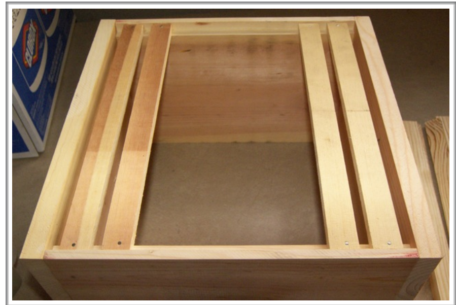
Hive Box with 4 top bars