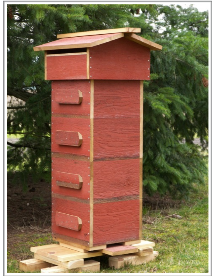
Warre Hive Built from Recycled Barn Cedar