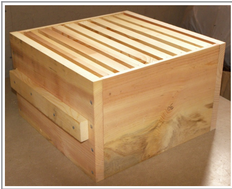
Hive Box with all 8 top bars

Each Hive Box has its own set of Top Bars. When the hive boxes are stacked on top of each other, the top bars in each box provide a foundation for the bees to build comb on.