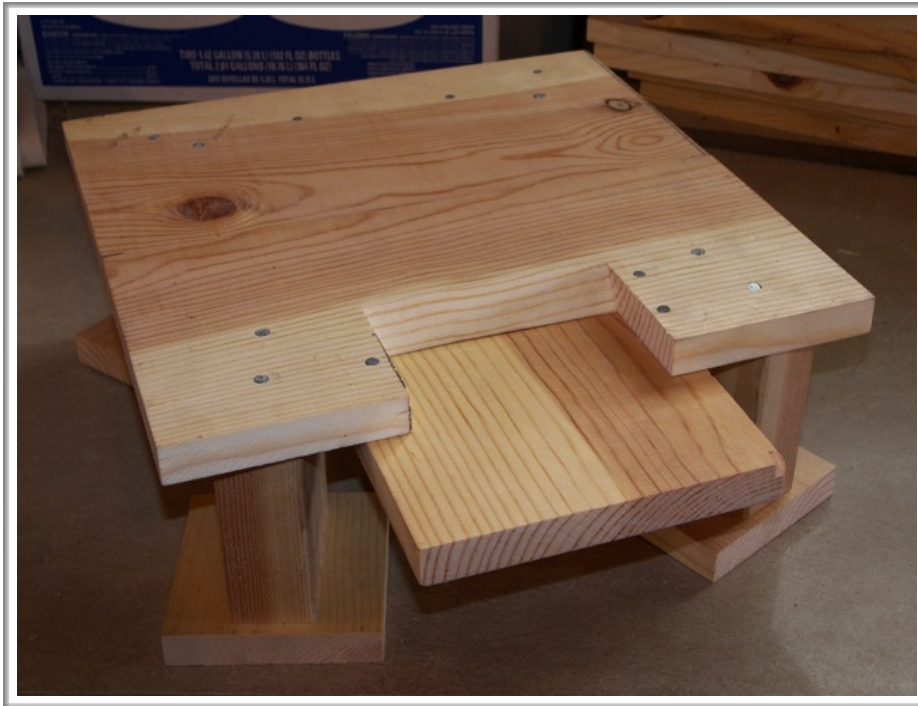
Warre Hive Floor with 4 legs

This provides the foundation for the whole beehive.