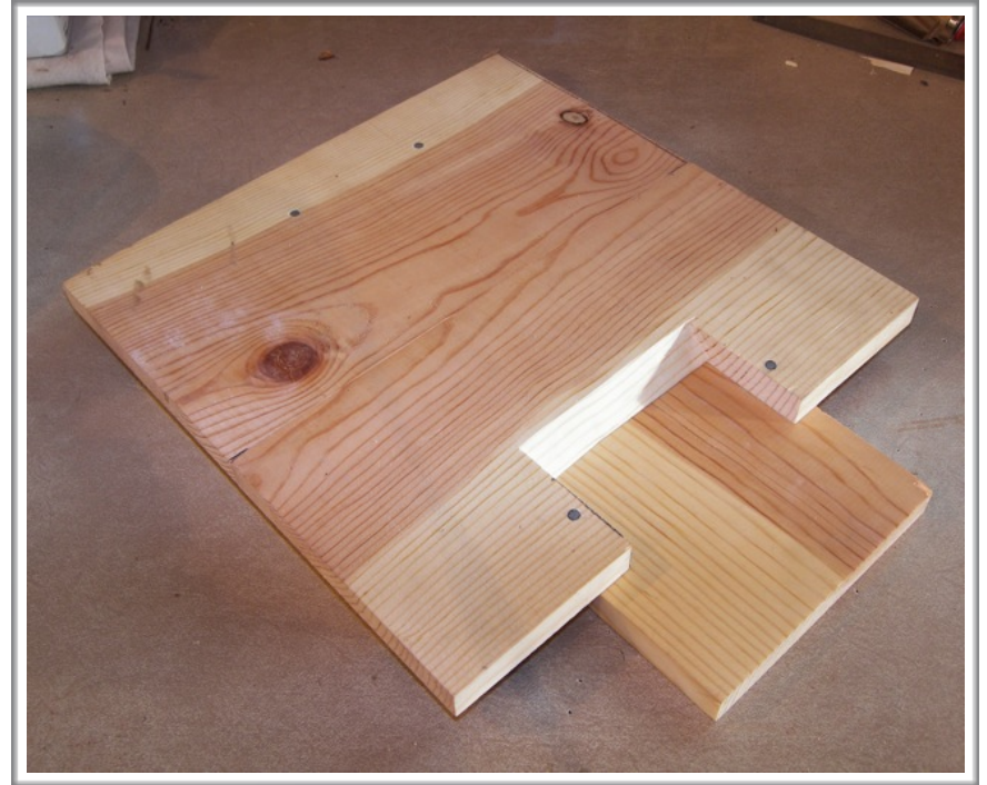
Warre Hive Floor without legs