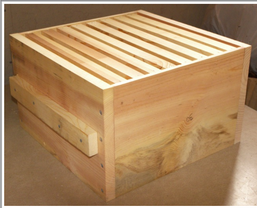
Warre Hive Box with Top Bars in place

Forms the basis of the hive. This is where the bees build their honeycomb.